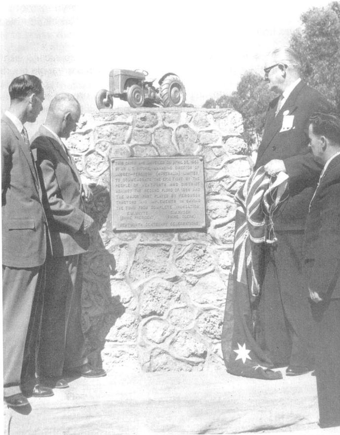
(extract from "By God and by Fergie ...we beat the flood" book)