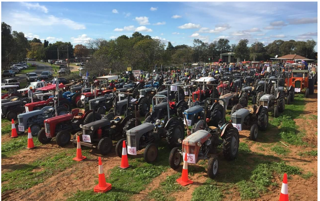
2016 Tractors line up at Ellerslie, NSW