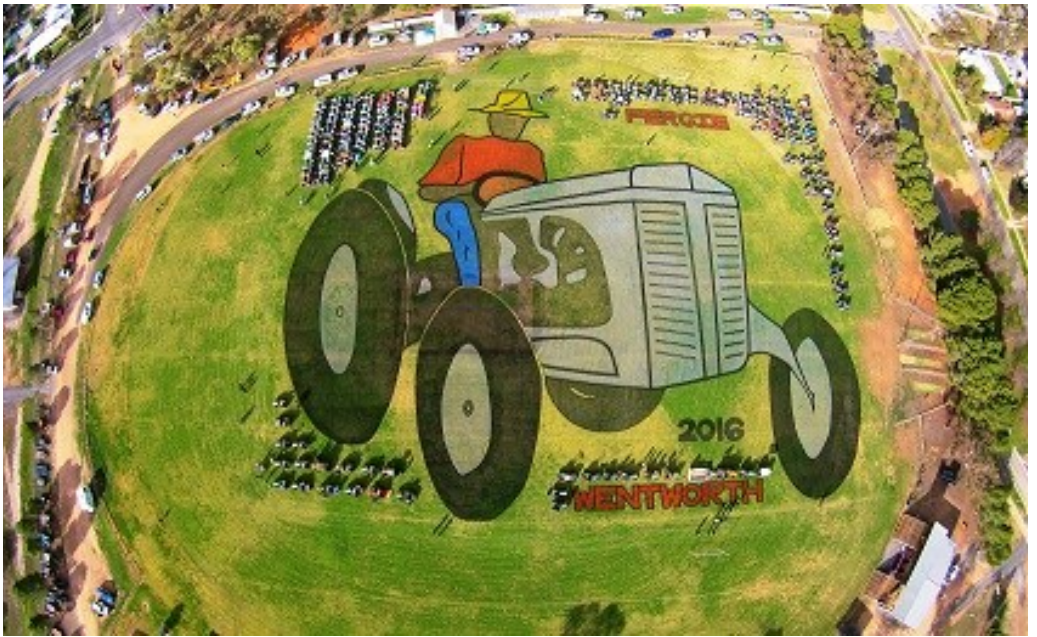
2016 McLeod Oval Tractor Aerial Image designed by Wentworth Shire Council staff